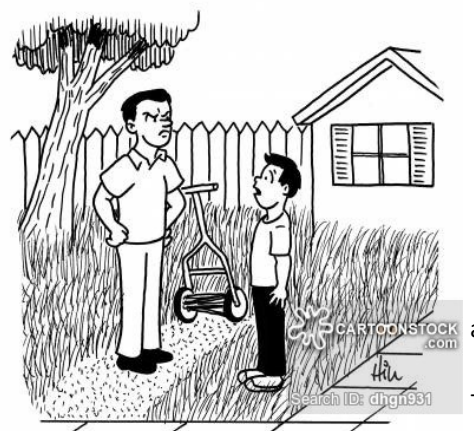
"YOU WANTED ME TO MOW ALL THE GRASS?"

As property owners and tenants, we have a responsibility for maintaining the right-of-way adjacent to our property in a clean and safe condition. This includes weed abatement by mowing tall grasses and weeds so that they do not become a fire hazard or just have a bad appearance in our respected community. Should tall weeds persist into the start of the fire season, it becomes mandatory to mow the noxious vegetation down. Non-compliance with controlling noxious weeds is municipal code violation. Please be a good neighbor and keep your property and the right of-way in good condition.